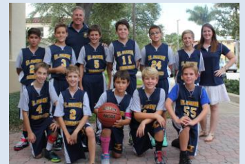
SACS JV Basketball 2014